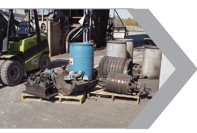
DESTROYED MOTOR & BEARINGS (EXISTING FAN)