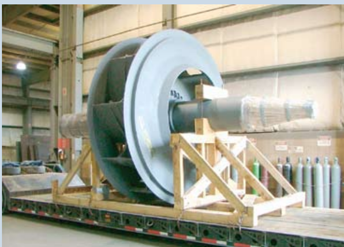
Cradled, twelve foot diameter rotor on a low bed truck ready for shipment to the site.