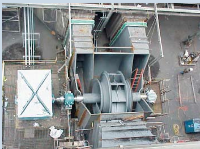
Aerial view of the fan installed, waiting for the top half of the housing and boxes to be installed.